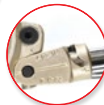
Easy 90° to 180° Switch! No Crossing of Handles!