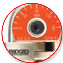
Clearly Visible Degree Marks for Accurate Bending