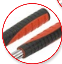
Ergonomic Cushioned Grips, Comfortable Use!

60% Less Force Required vs. Traditional Benders