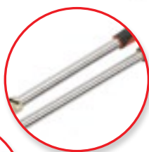
Extra Long Handles, More Leverage, Reduced Force!