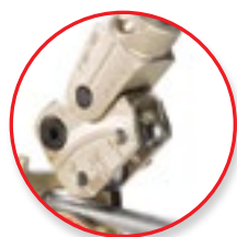
Roller Dies Reduce Force and Tube Flattening